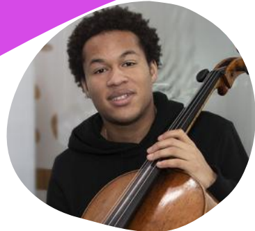
Sheku Kanneh-Mason | Cellist